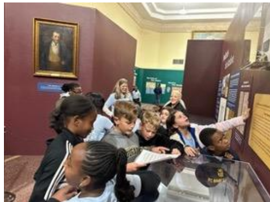
Fourth Grade went to the San Jacinto Monument last Wednesday to learn more about Texas History. They watched a movie on Texas History and the Battle of San Jacinto and had a great time completing a scavenger hunt.